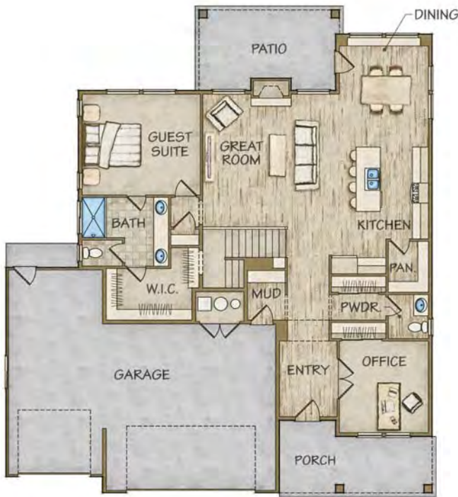
*Plans are subject to change.